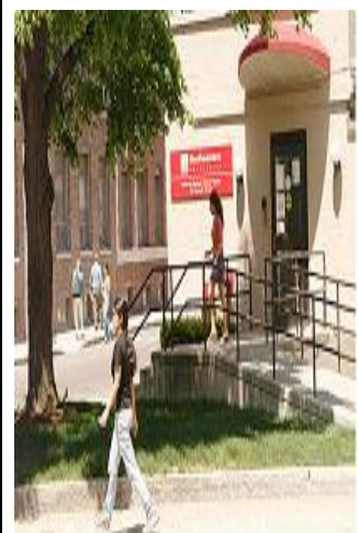
Latino/a Student Cultural Center 104 Forsyth Street Boston, MA 02115 M-F Time...